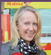
Liz McInnes MP Heywood & Middleton