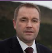
Neil Findlay MSP