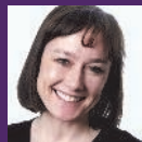
Jo Stevens MP, Cardiff Central