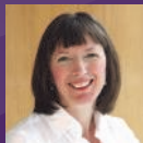
Frances O'Grady, TUC General Secretary