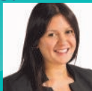
Lisa Nandy MP